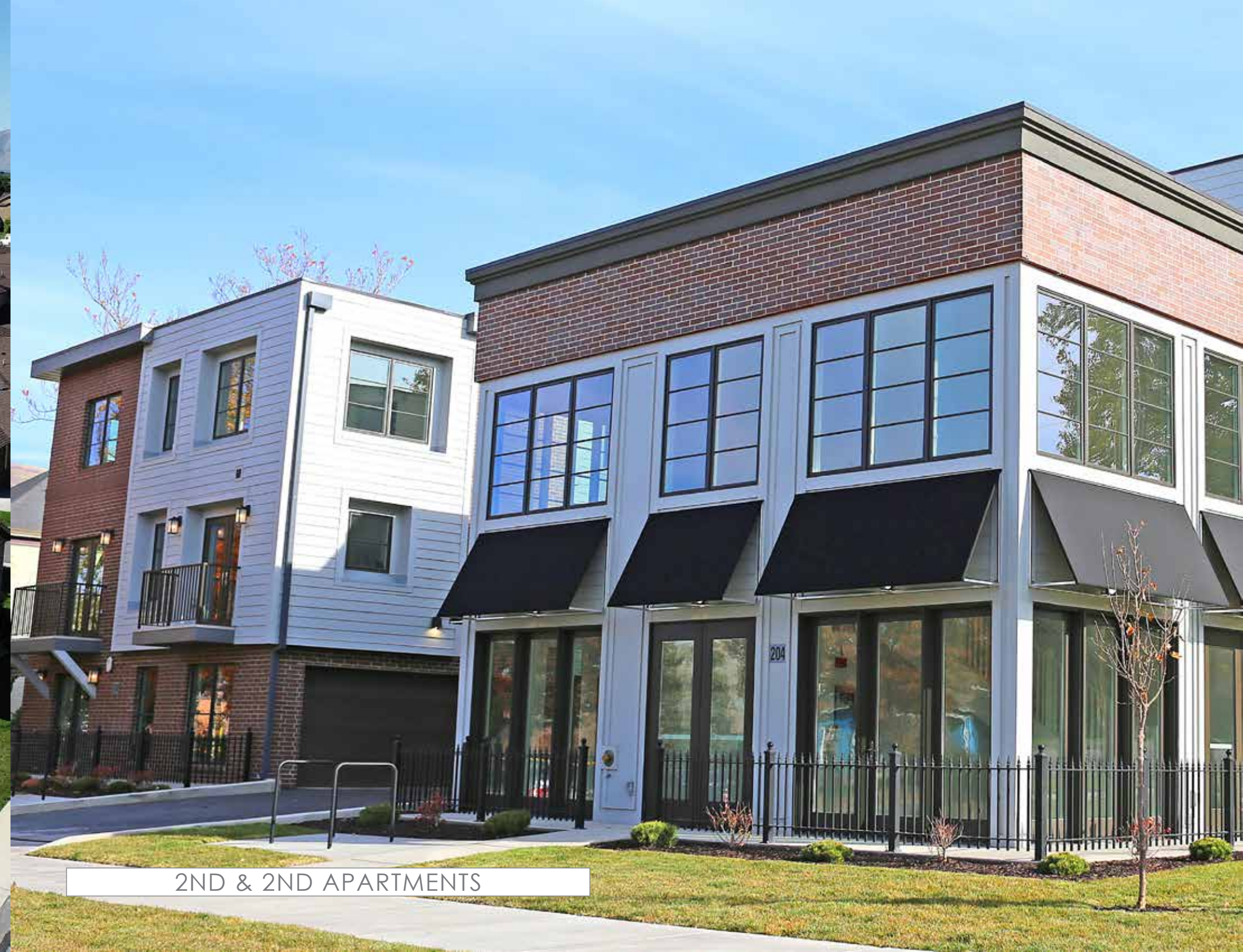
2ND & 2ND APARTMENTS