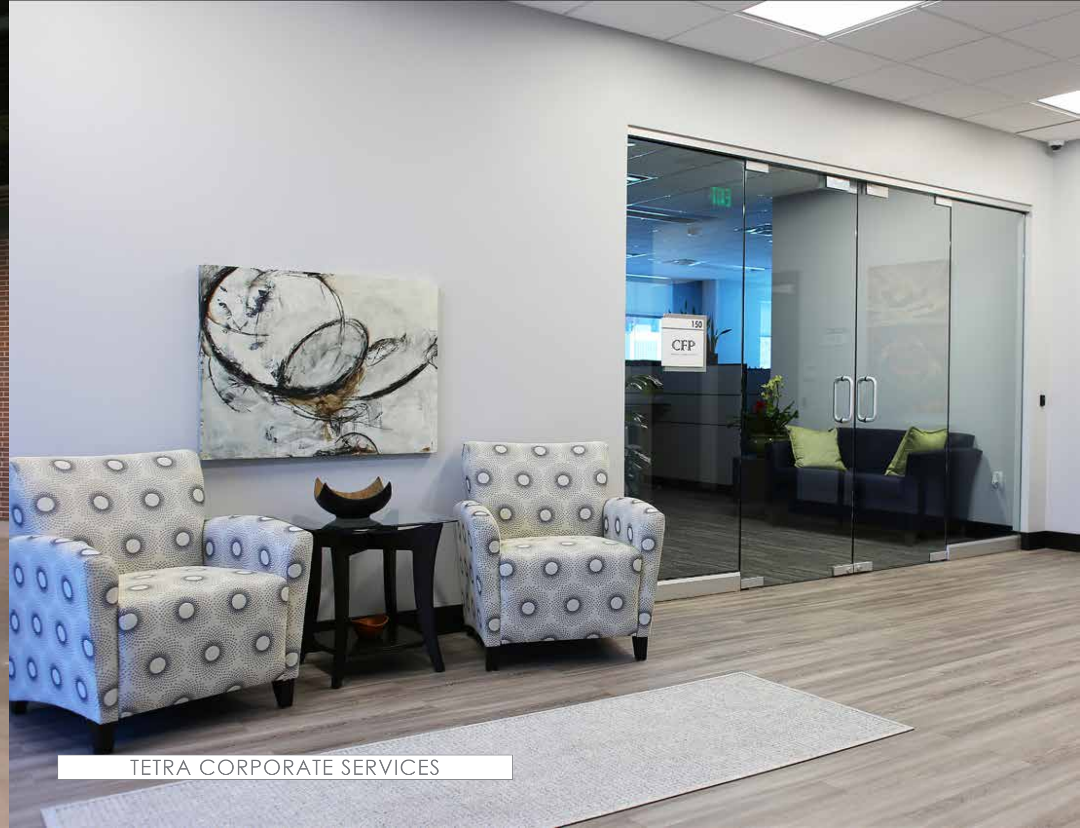
TETRA CORPORATE SERVICES