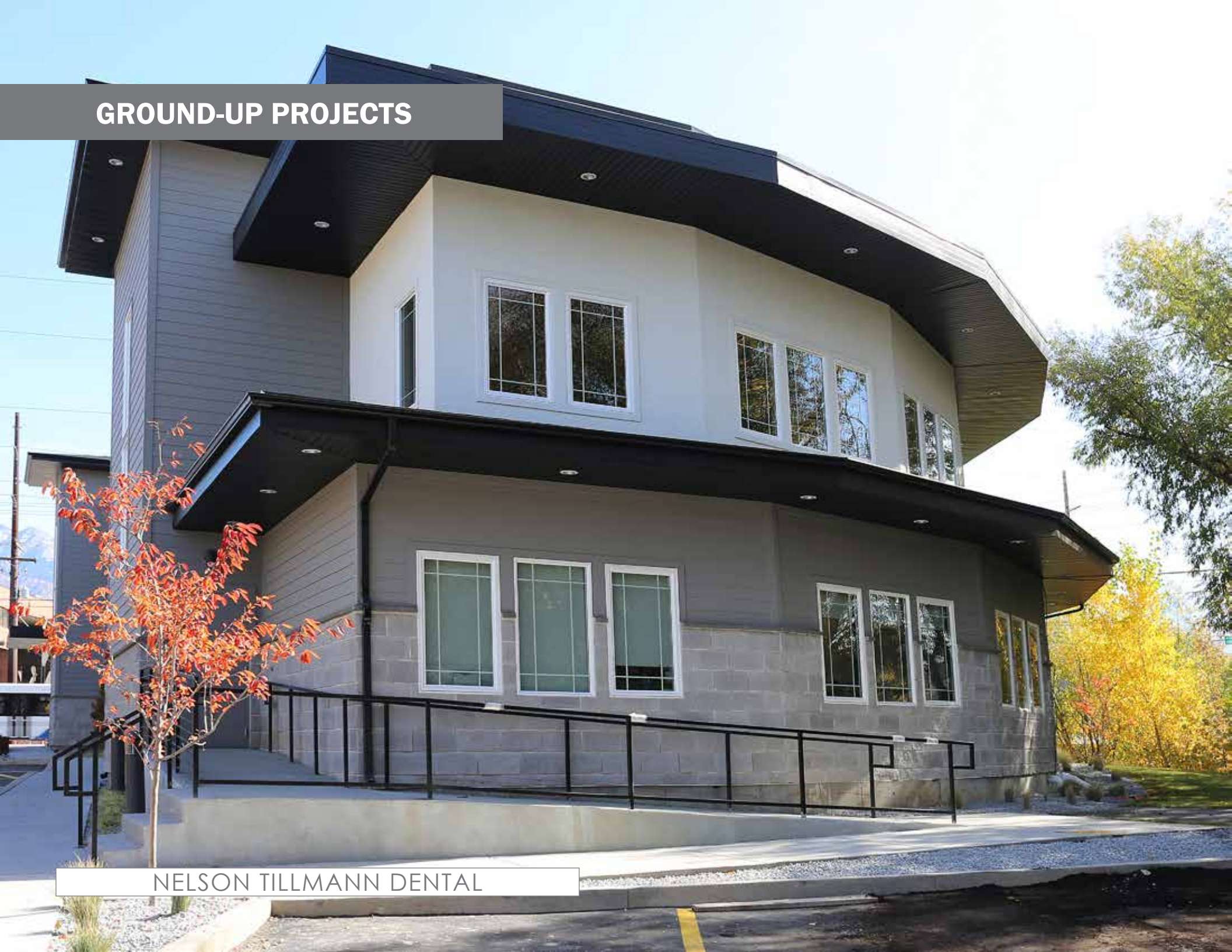
NELSON TILLMANN DENTAL