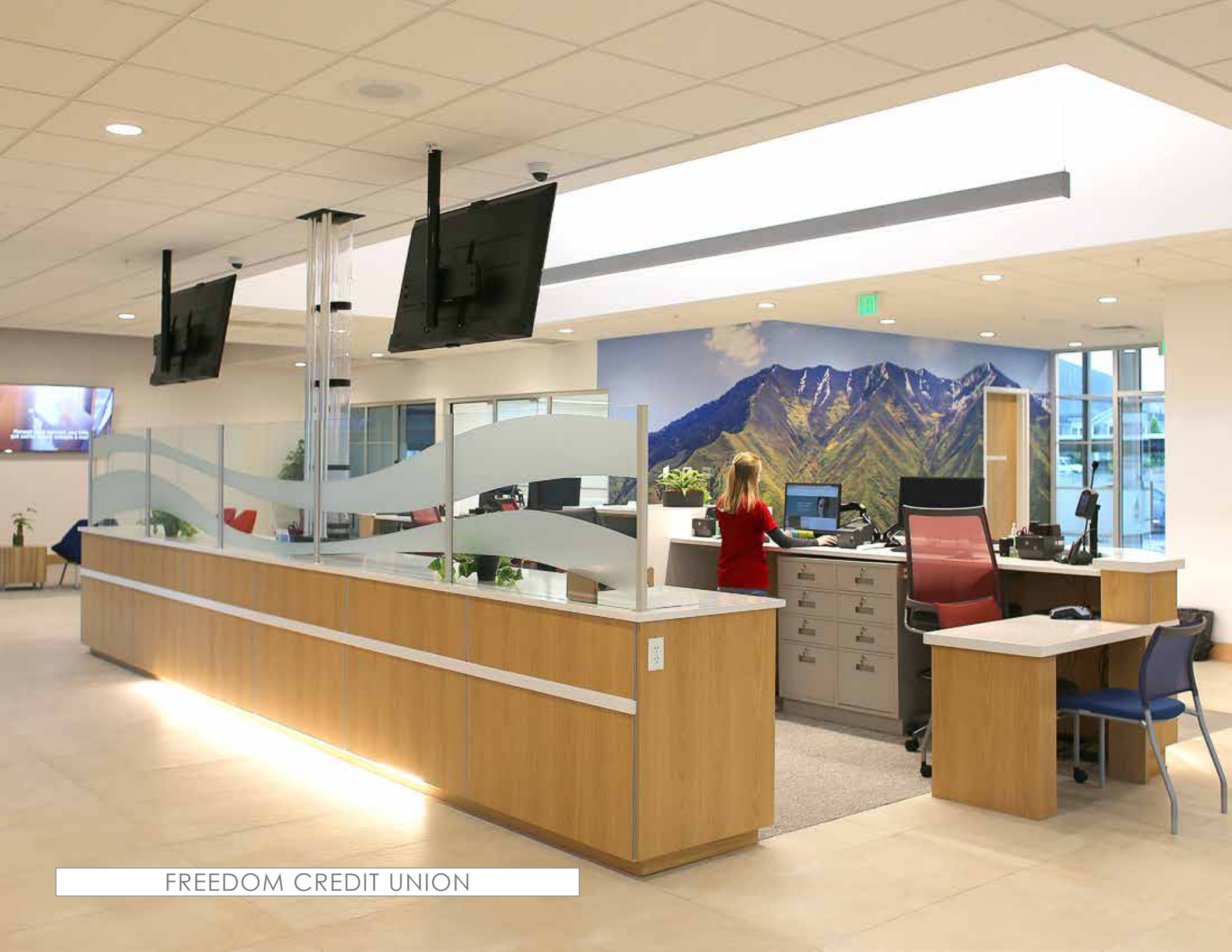
FREEDOM CREDIT UNION