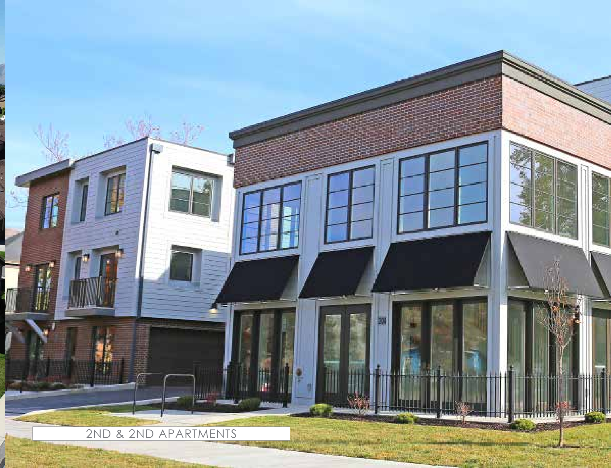
2ND & 2ND APARTMENTS