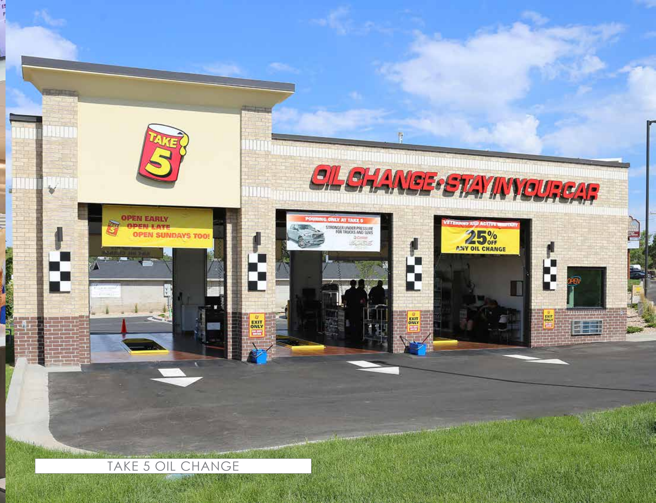
TAKE 5 OIL CHANGE