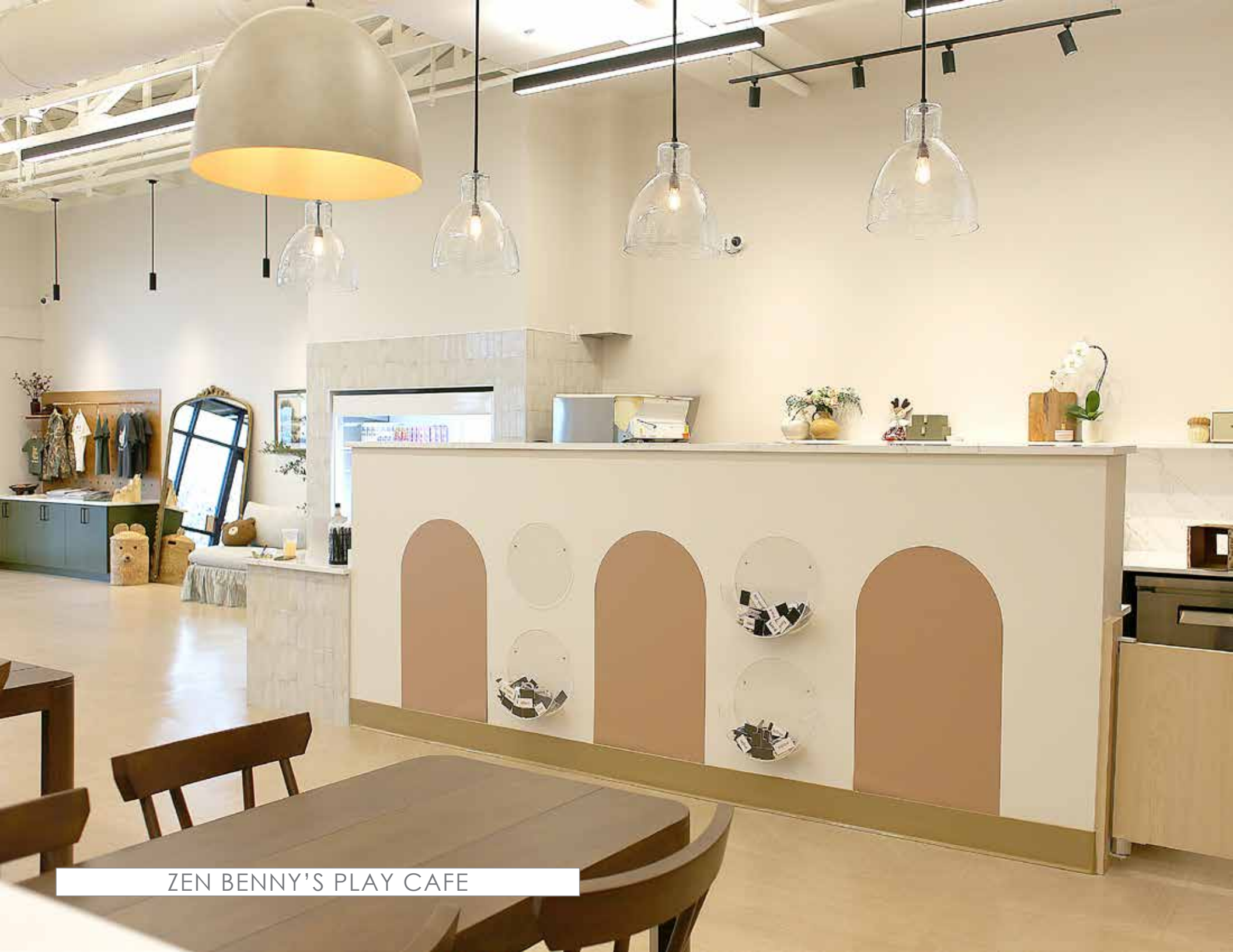
ZEN BENNY'S PLAY CAFE