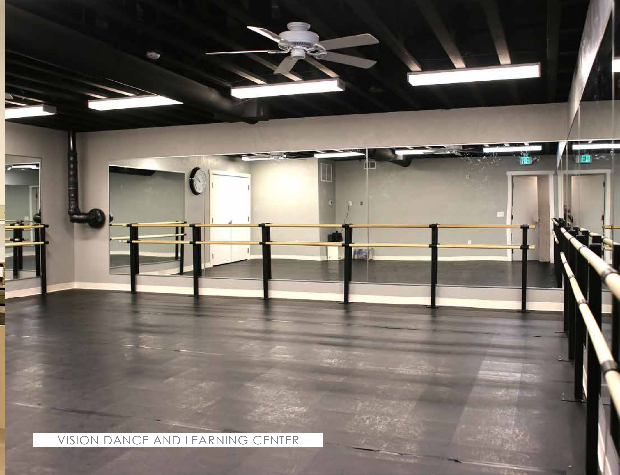
VISION DANCE AND LEARNING CENTER