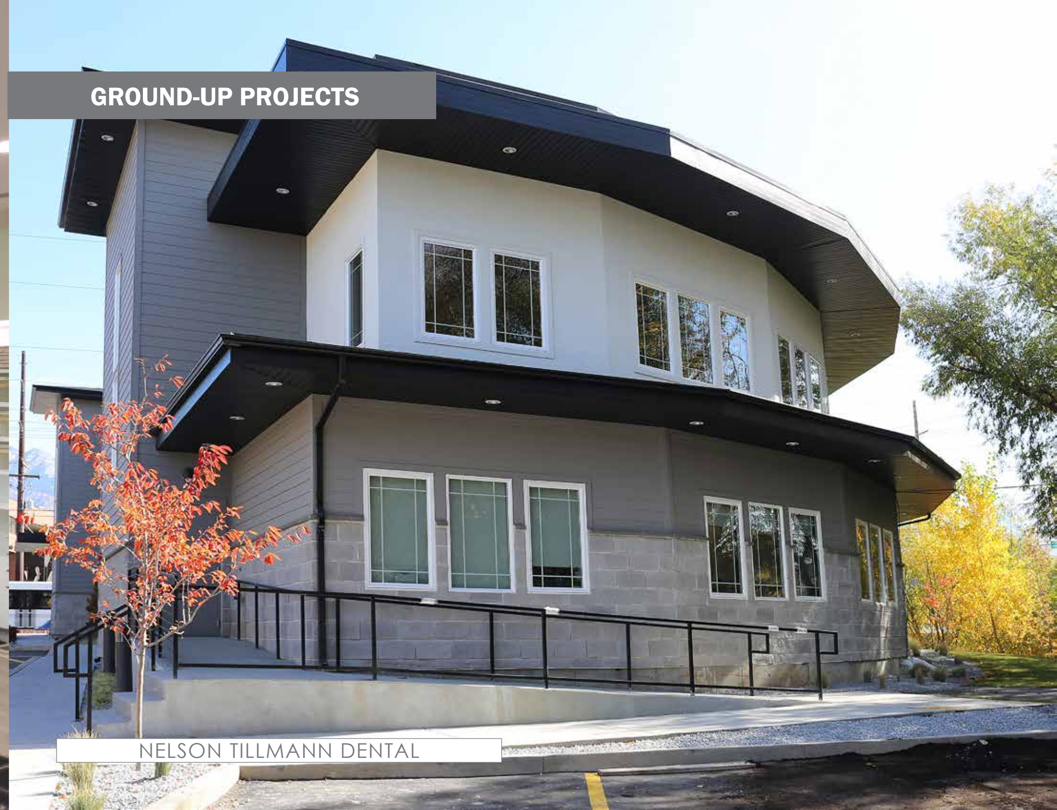
NELSON TILLMANN DENTAL