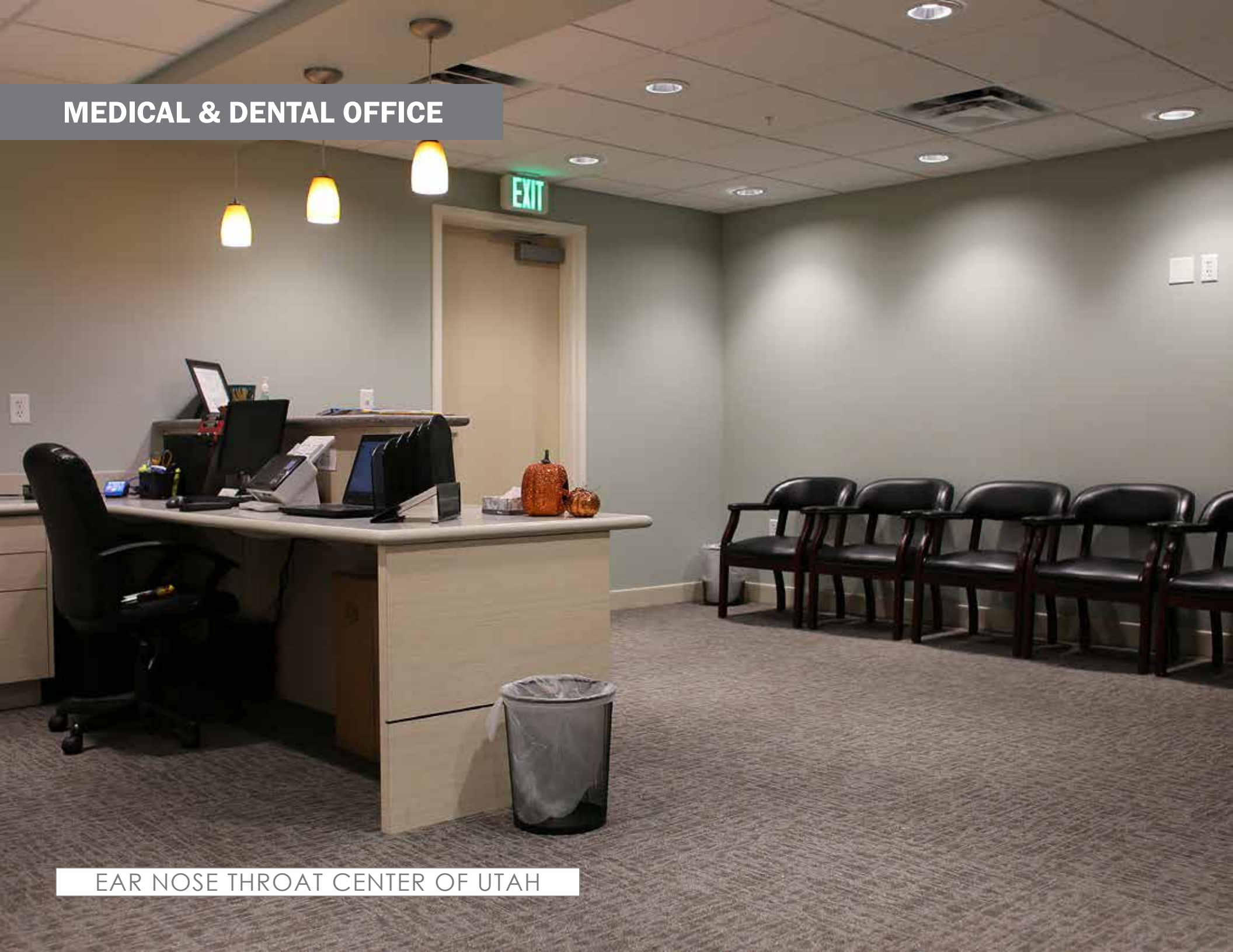
EAR NOSE THROAT CENTER OF UTAH