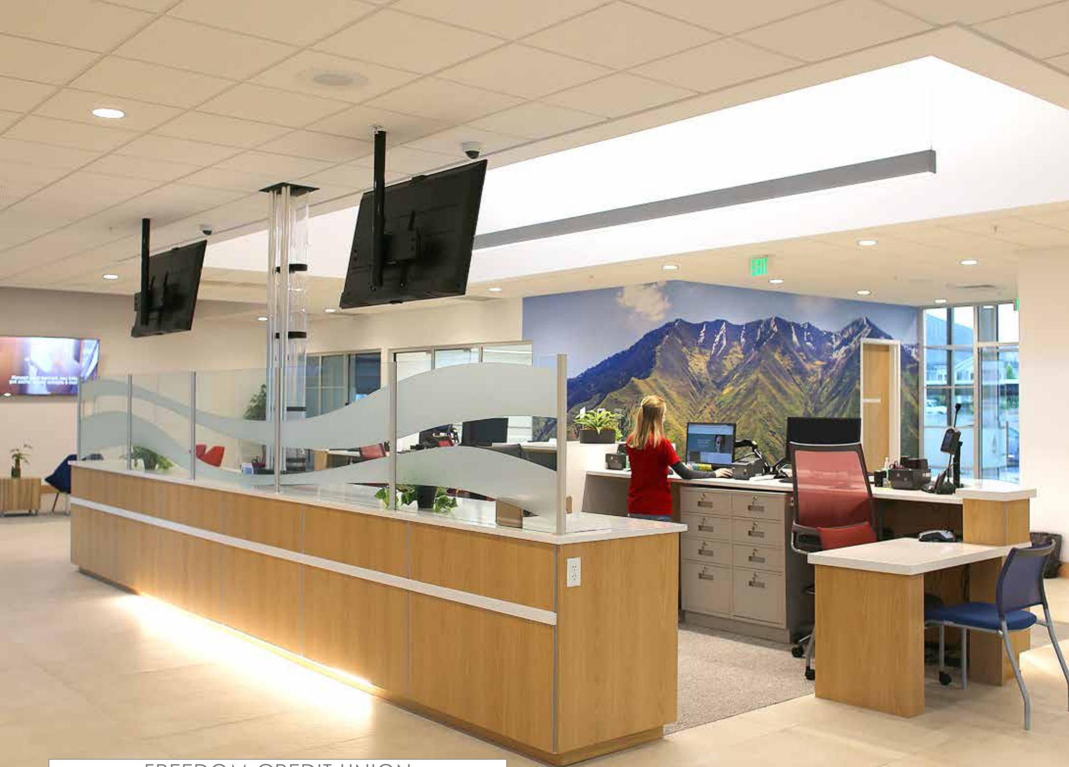
FREEDOM CREDIT UNION