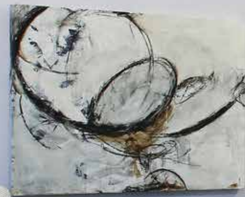
TETRA CORPORATE SERVICES