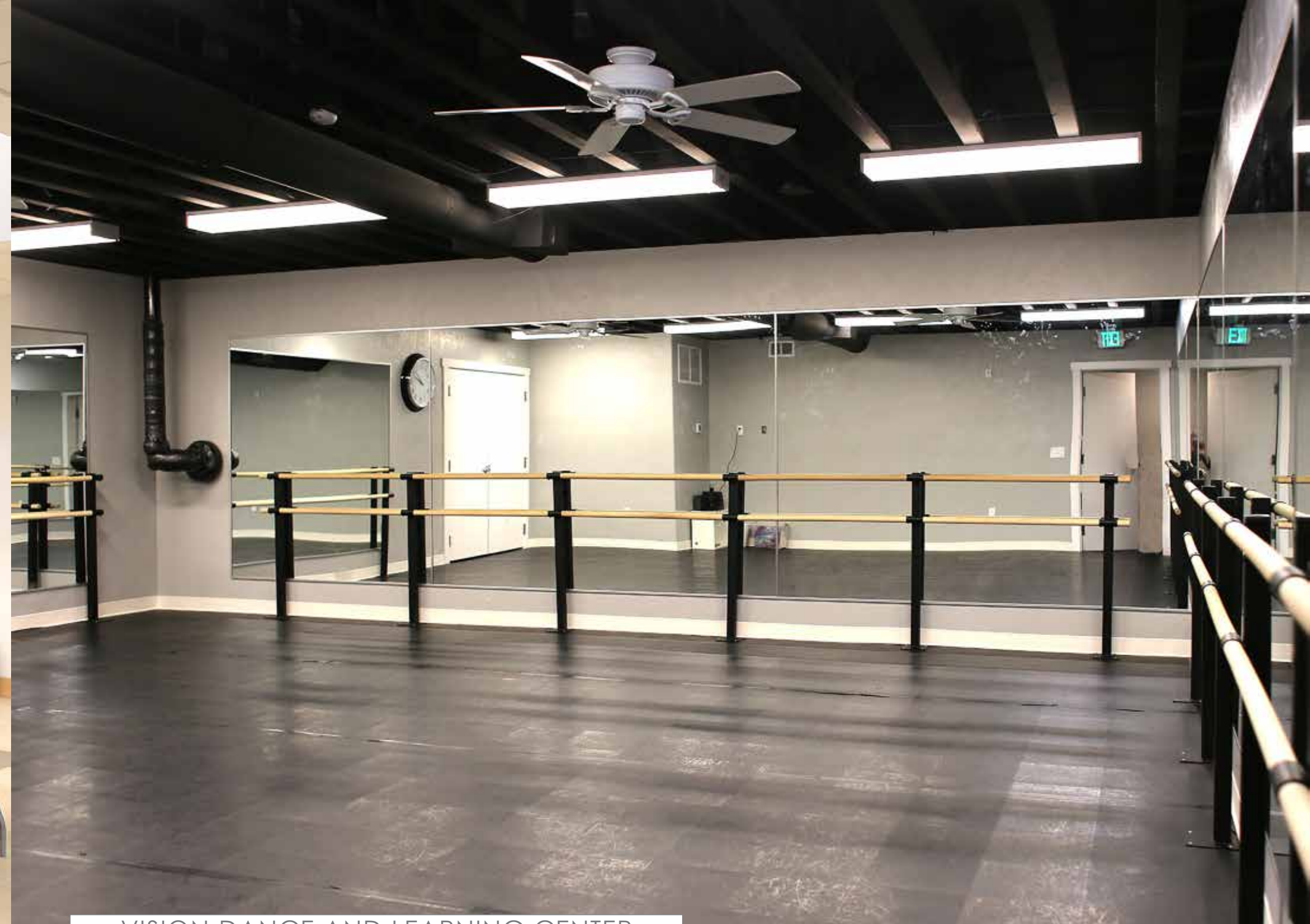
VISION DANCE AND LEARNING CENTER