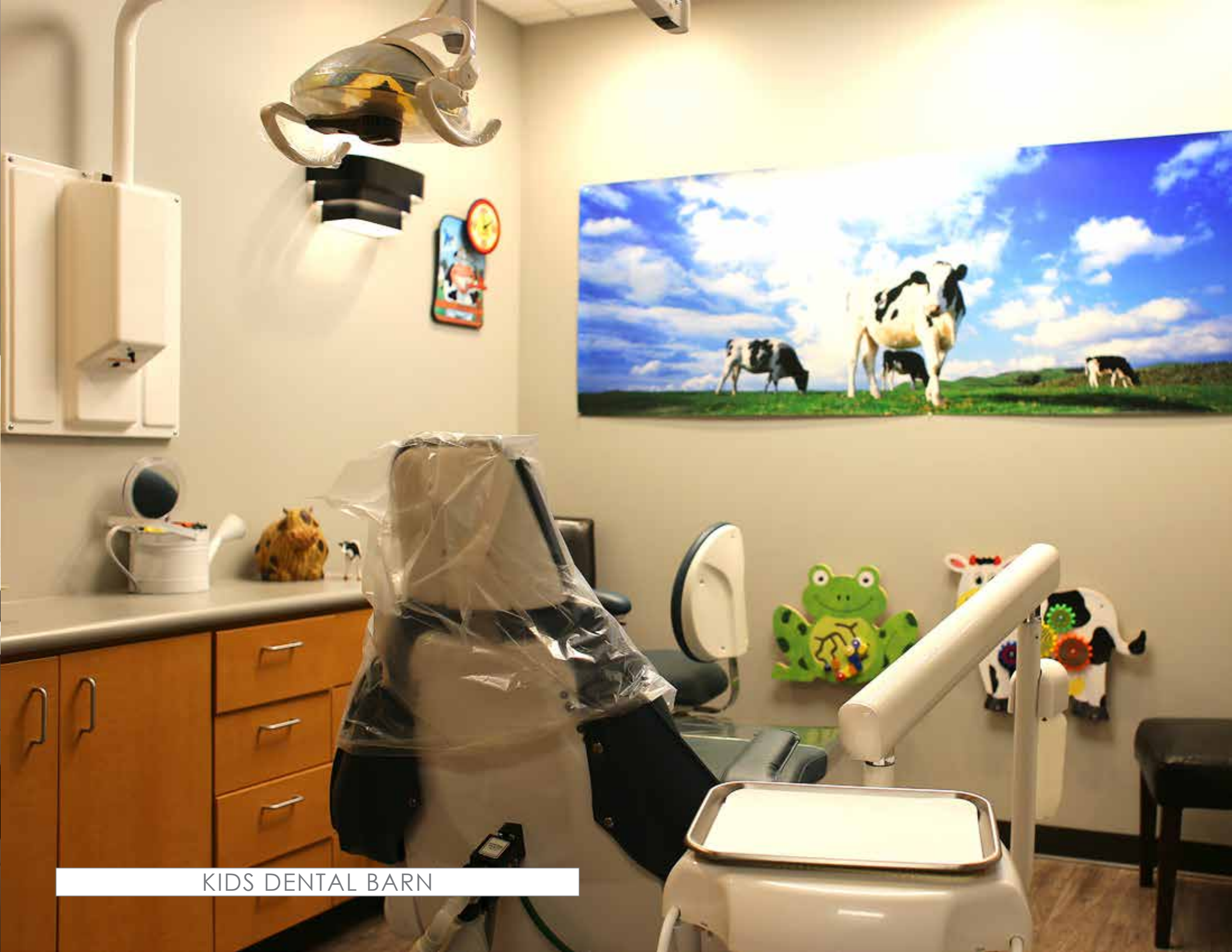
KIDS DENTAL BARN