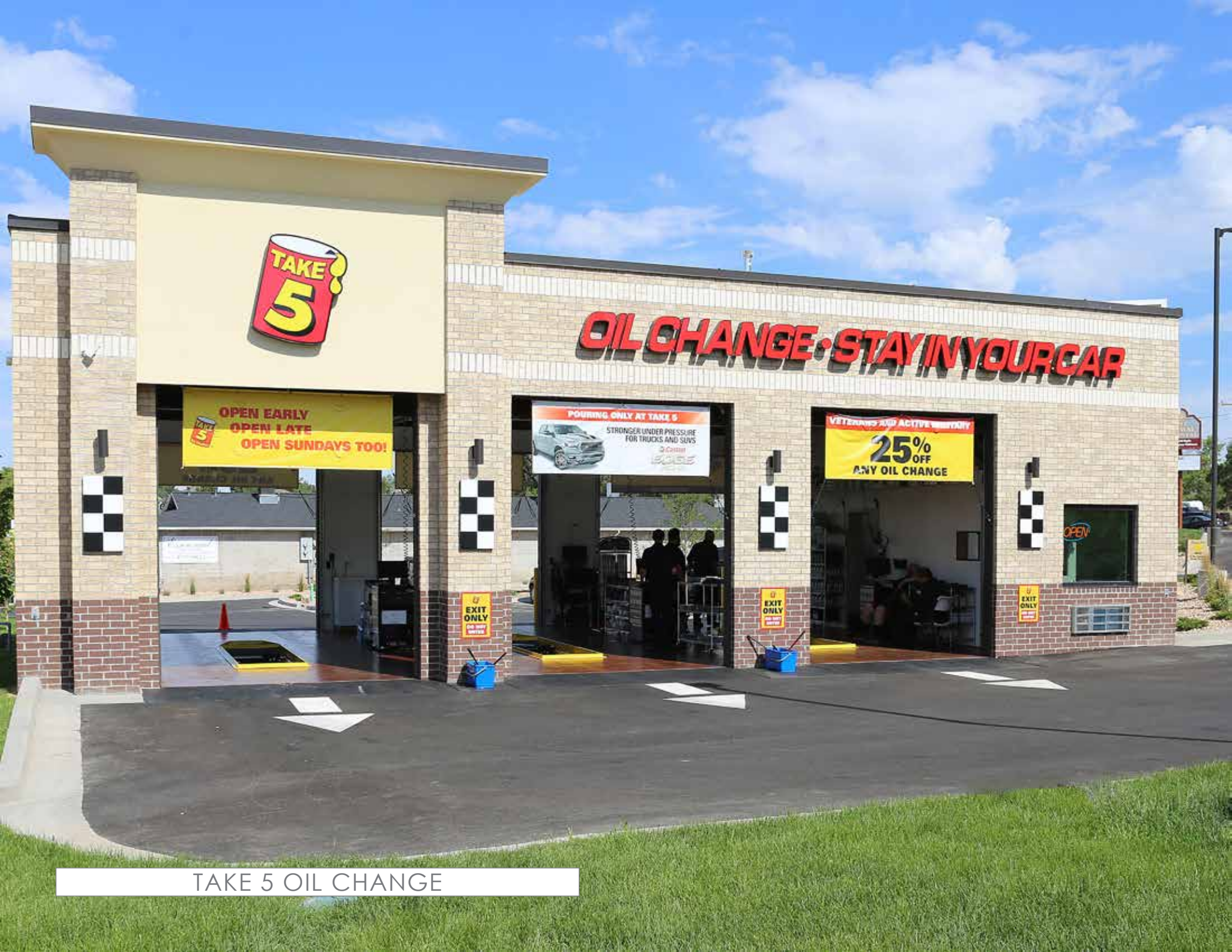
TAKE 5 OIL CHANGE