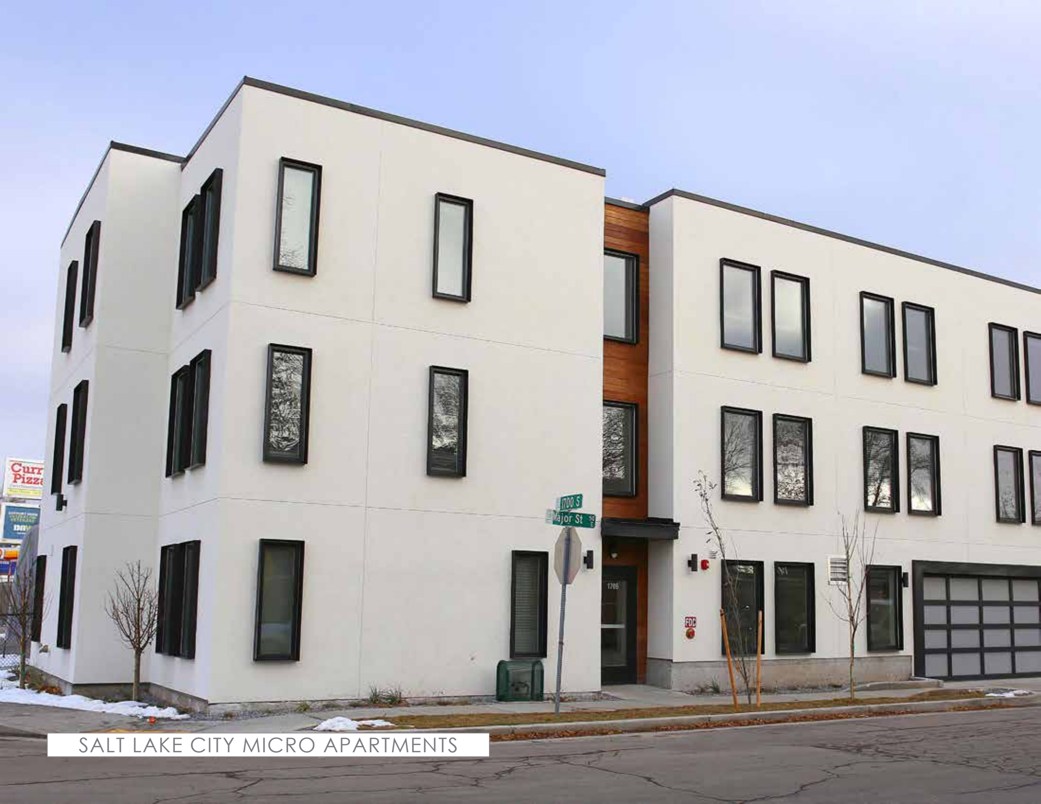
SALT LAKE CITY MICRO APARTMENTS