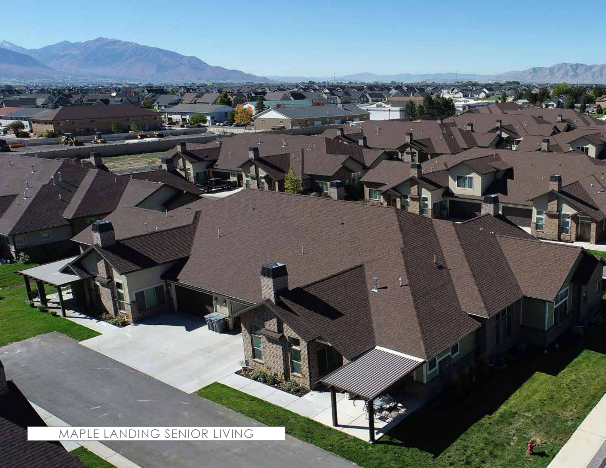
MAPLE LANDING SENIOR LIVING