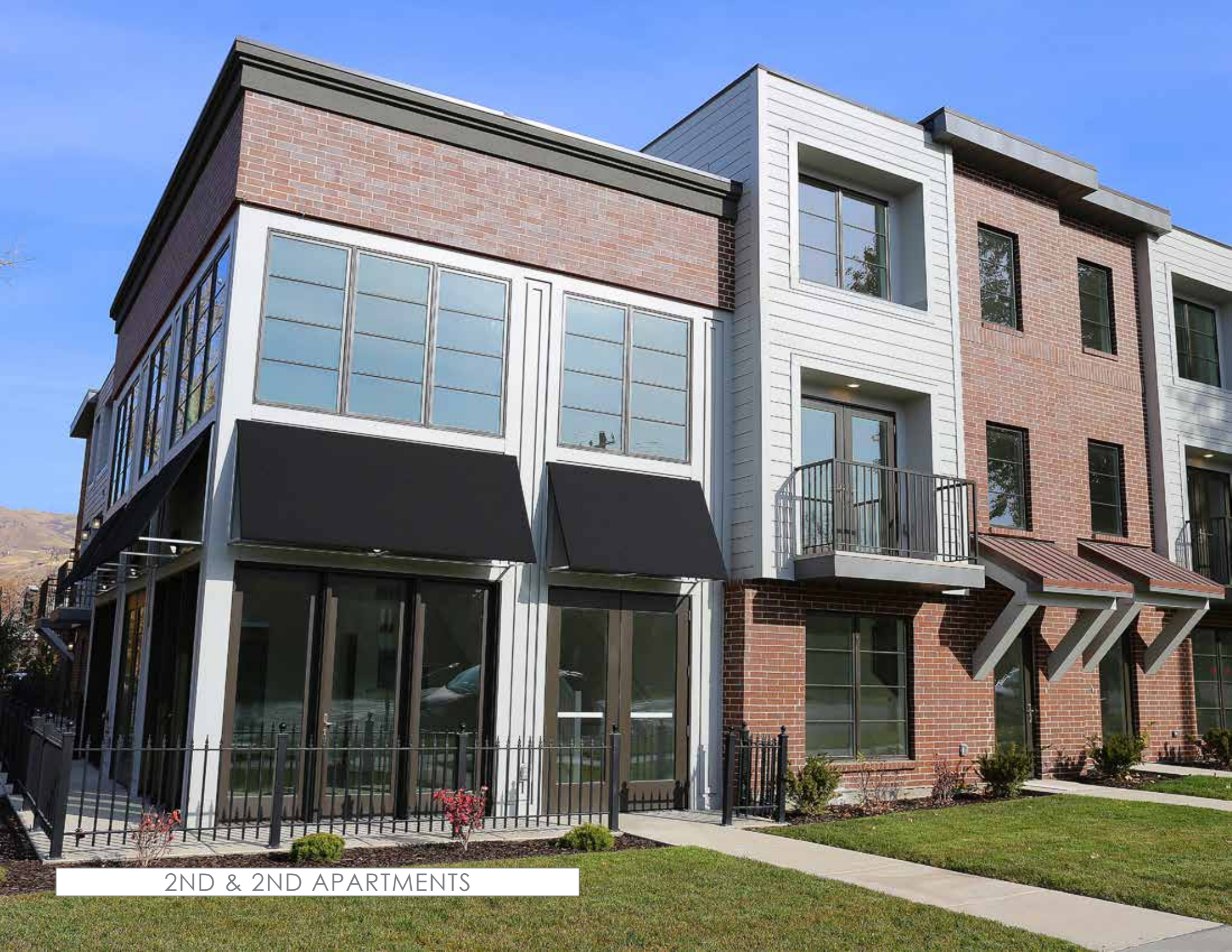
2ND & 2ND APARTMENTS