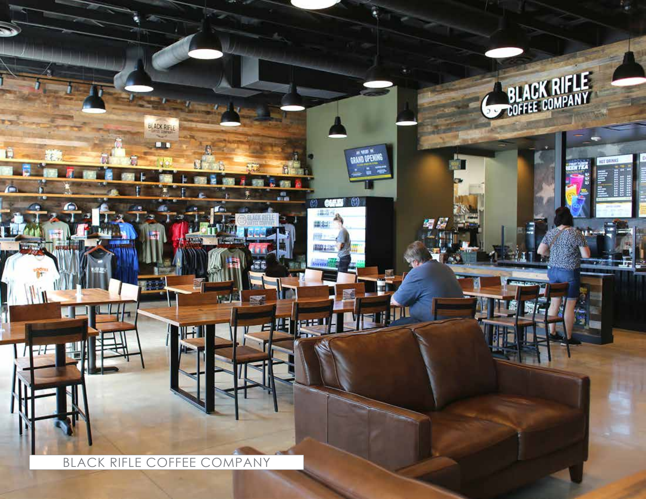
BLACK RIFLE COFFEE COMPANY